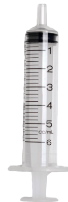
LUER SLIP TIP